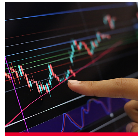
Margins and Settlement